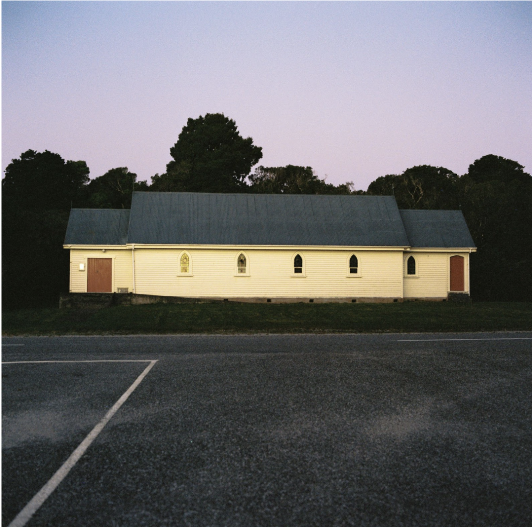
Okuru Hall, Haast - South Westland. Aotearoa/New Zealand